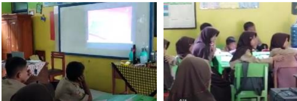
Figure 2. Students watch the process of planting pak choy using a hydroponic system

The learning tools that had been prepared were then implemented for sixth-grade students. There were five activities according to the plan, namely Introduction to tools, materials, and tools for planting hydroponic pak choy with video playback. This activity led students to knowledge about the interdependent relationship between biotic and abiotic components. Students could also acknowledge the sequence of planting and caring for pak choy until harvest (Figure 2). Below is a student's activity while watching a video of the stages of planting pak choy from preparing tools/materials, and sowing, to harvesting.