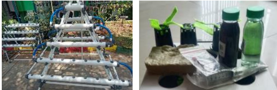
Figure 1. Tools and Materials for Planting Bok Choy Vegetables with a Paralon Hydroponic Installation

At the planning stage, the team agreed that an integrated STEAM-H learning approach would be carried out through project-based learning. The project that would be carried out was planting and maintaining vegetable plants in pipe installations. The vegetable grown was pak choy. Figure 1 below shows the tools and materials used by students as learning media.