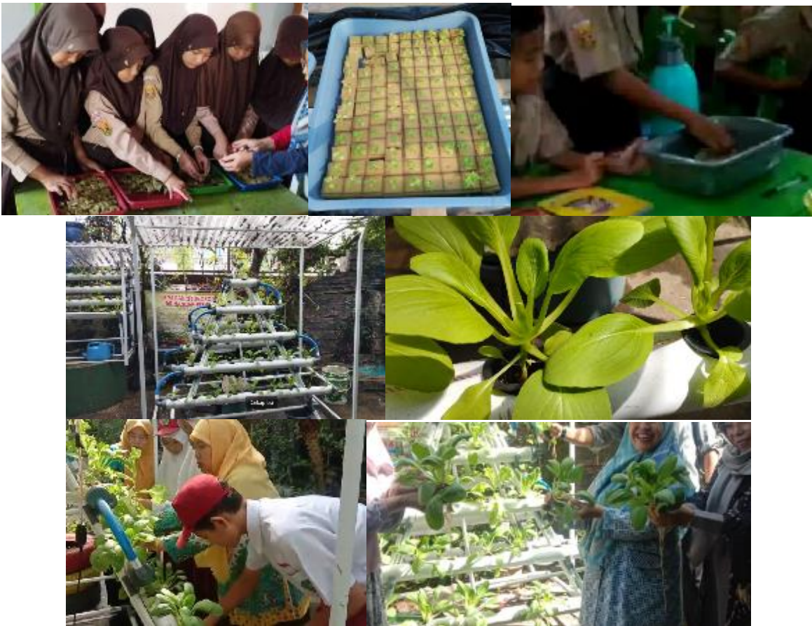
Figure 4. Students maintain vegetables until harvest accompanied by the teacher

Students always observed the growth of the seeds and cared for them until they were ready to be transferred into net pots. Furthermore, students also looked after the plants until harvest.