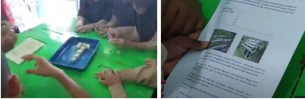
Figure 3. Students do the seeding and fill in the worksheet

Students always observed the growth of the seeds and cared for them until they were ready to be transferred into net pots. Furthermore, students also looked after the plants until harvest.