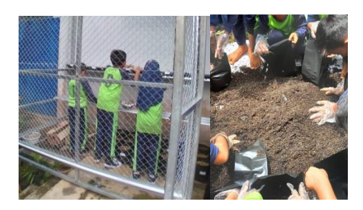
Figure 4. Activities for Sowing Seeds and Making Planting Media