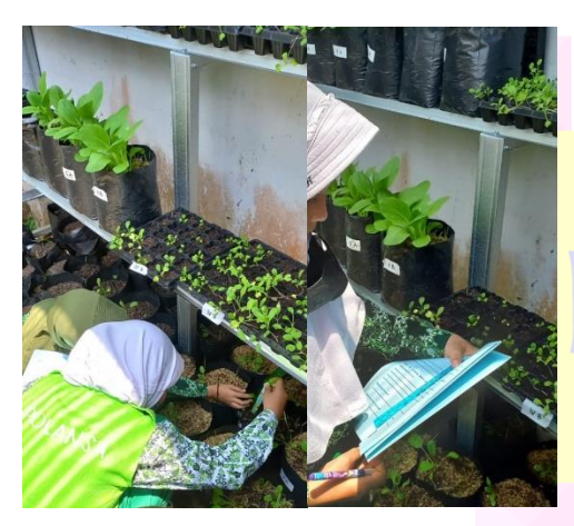
Figure 5. Activities of Caring for Vegetables and Filling in Worksheets