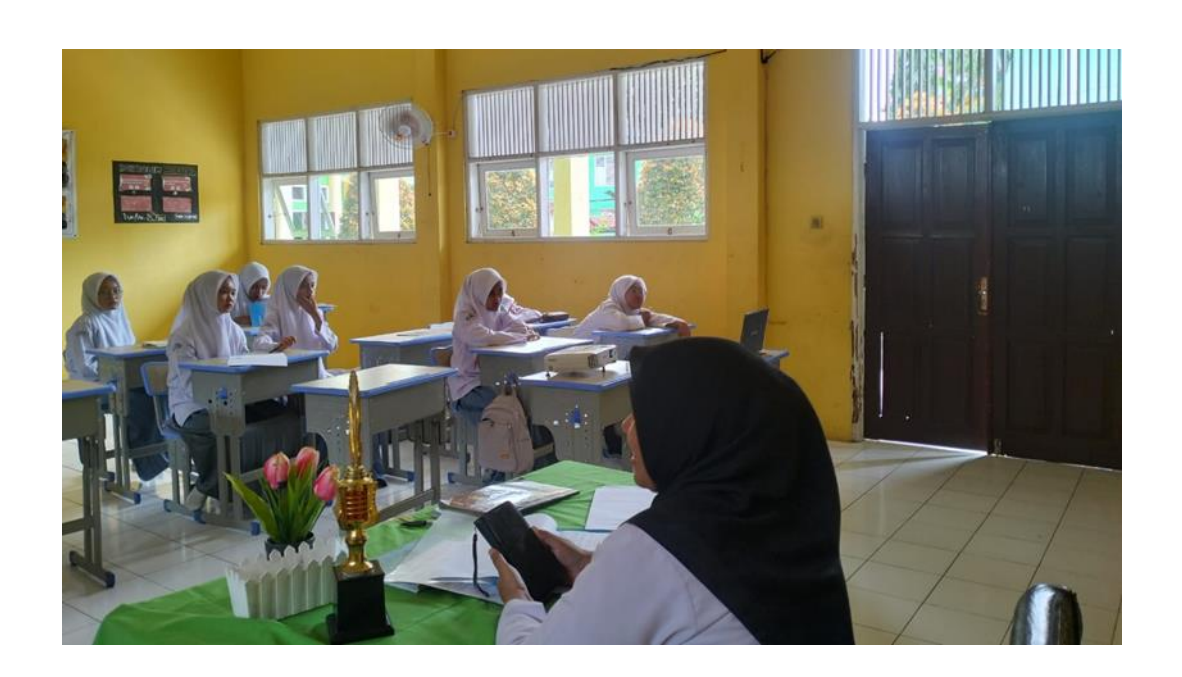
Teaching Learning Process 2