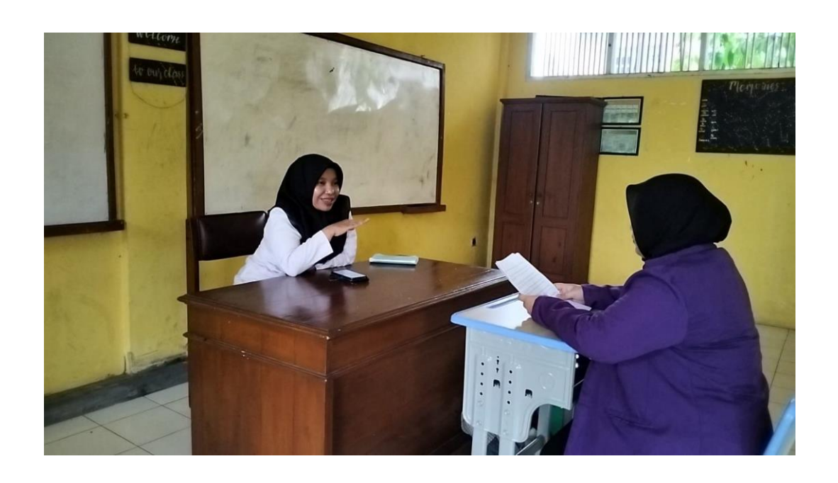
Interview with teacher 1