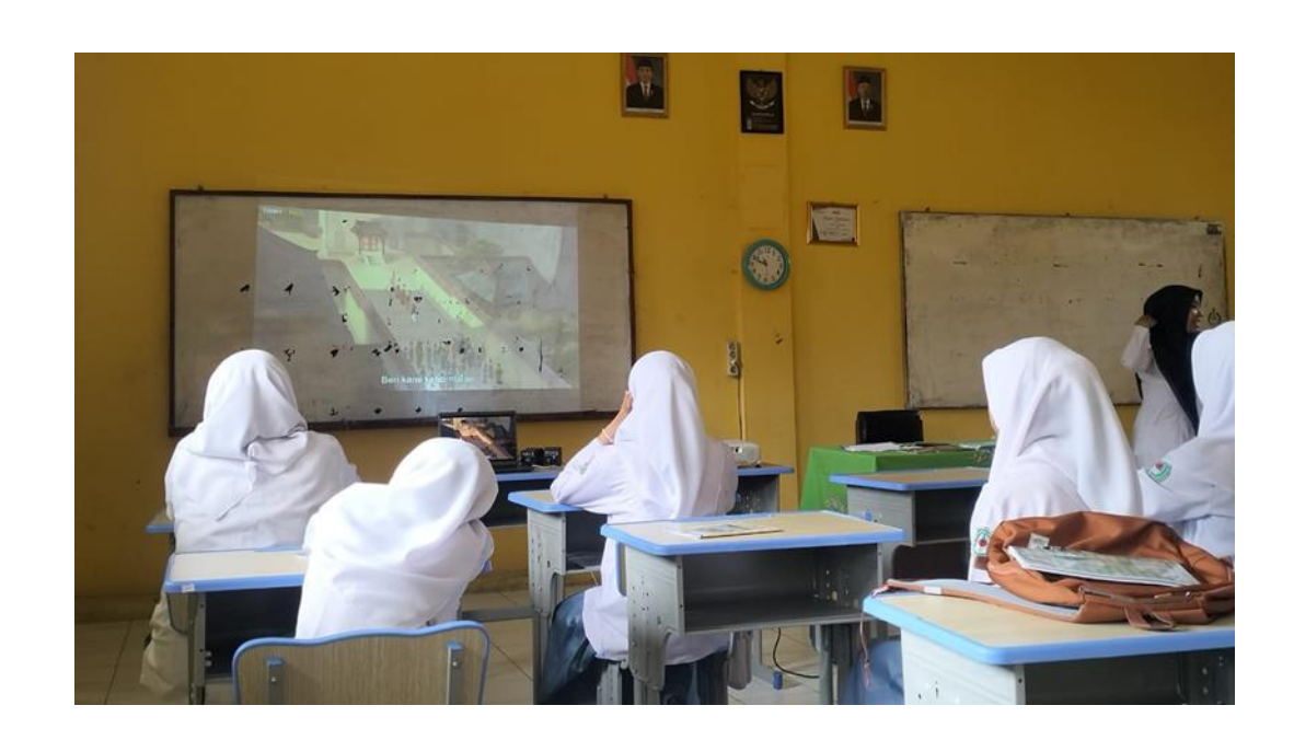
Teaching Learning Process 3