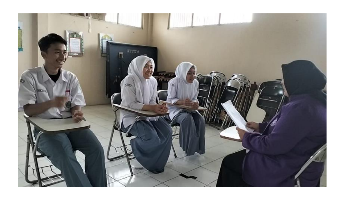
Interview with students 1