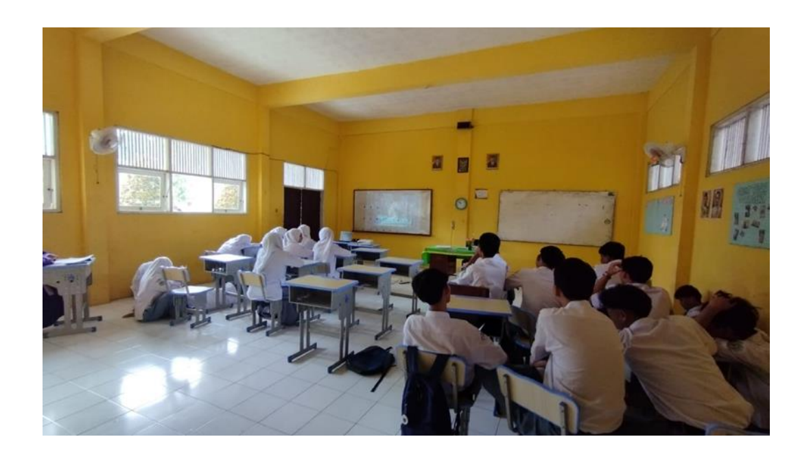
Teaching Learning Process 4