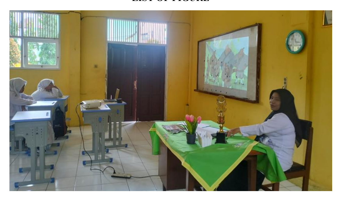
Teaching Learning Process 1