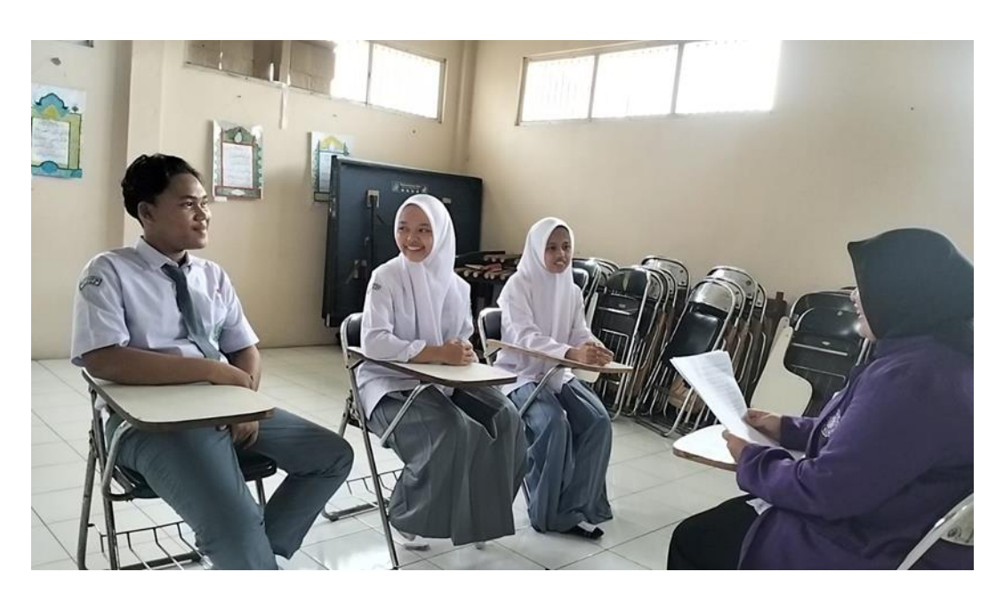
Interview with students 3