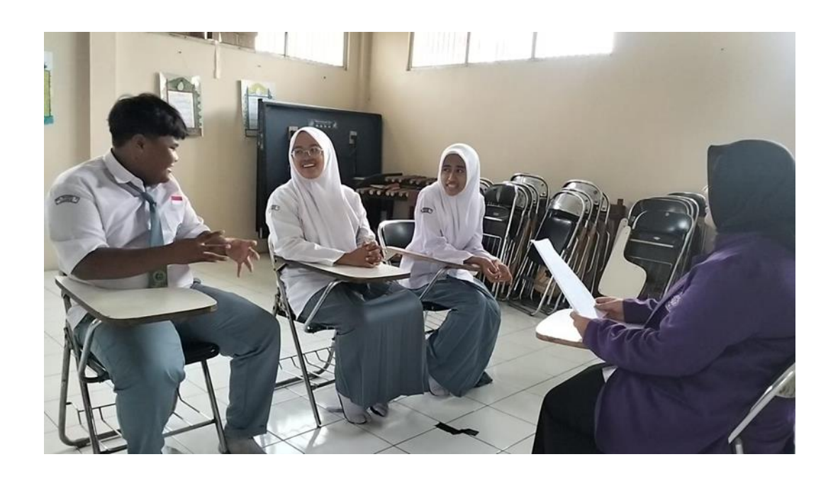
Interview with students 2