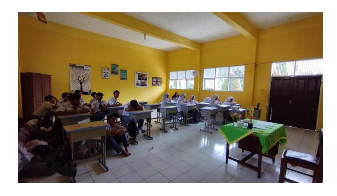
Teaching Learning Process 5