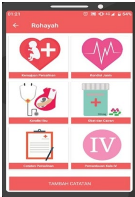
Figure 1. Patient labor information menu of digital partograph

recording data and information menu of patients in the active phase of labor in digital partograph are shown in Figures 1 and 2.