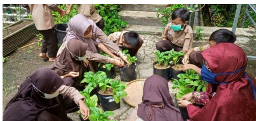
Figure 6. Student Activities Harvesting Vegetables

The results obtained by students from the implementation stage were knowledge and experience of growing vegetables from sowing, planting, and caring for vegetables. The results of the observations of the team and