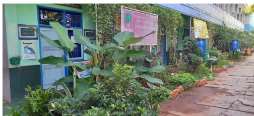
Figure 1. MI Handapherang Schoolyard (Front)

MI Handapherang has various programs to realize the Adiwiyata school. The active participation of school residents to realize environmental-based school facilities. Many of the plants on the school grounds are very well maintained. Plants are dominated by ornamental plants arranged in neat rows. These ornamental plants make the school look clean, healthy, and beautiful.