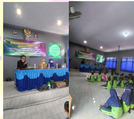
Figure 3. Counseling on Vegetables and the Role of Mathematics

There were 55 students from grades 4A and 4B who actively participated and were divided into 10 groups. Students are first given an understanding of vegetable plants and the role of mathematics in the practice of growing vegetables as shown in Figure 3 below.