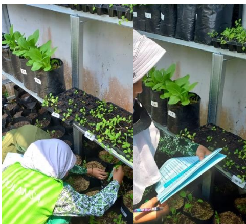
Figure 5. Activities of Caring for Vegetables and Filling in Worksheets