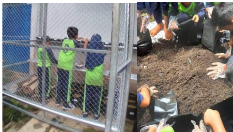
Figure 4. Activities for Sowing Seeds and Making Planting Media