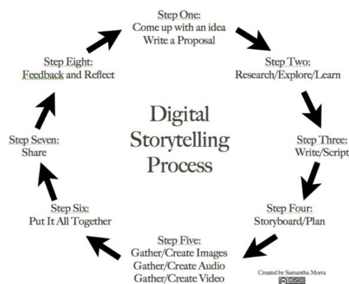
Figure 1. Digital storytelling process